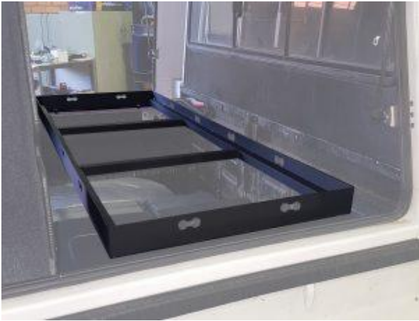
AMMO BOX RACK